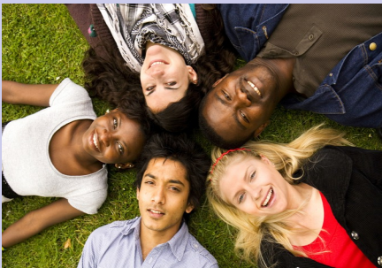
Changing Lives With Love, Support & Education